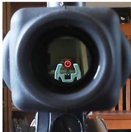
IMAGE - 3 Shows a LUCID HD7 with a properly adjusted reticle brightness as a sample of a proper reticle image.